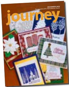
ON THE COVER: Homemade Christmas cards (see pages 8-9)